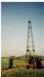
Drilling rig at Lisheen