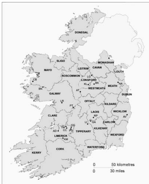
County Map of Ireland showing locations mentioned in italics in the text. Adare (AD), Athlone (AT), Avoca (AV), Ballinalack (BK), Bohaun (BN), Caherconlish (CC), Castlegarde (CG), Cregganbaun (CB), Galmoy (GY), Keel (KL), Kilmallock (KM), Lisheen (LI), Lough Gowna (LG), Loughrea (LR), Navan (NA), Pallas Green (PG), Portumna (PT), Rapla (RP), Tobermalug (TM), Tullybuck-Lisglassan (TL)

In April, Conroy Diamonds and Gold Plc (Conroy) reported more results from their gold exploration programme in the Lower Palaeozoic rocks of the Longford – Down massif. A programme of closely-spaced deep overburden sampling has identified two new zones of anomalous gold. The discoveries in Cargy, Co Armagh and Rackwallace, Co Monaghan lie northeast and southwest respectively of the company's Tullybuck-Lisglassan prospect. Both anomalous zones trend NW-SE, are approx 300m long, and are open at both ends. Values of up to 190ppb Au were returned at Cargy and up to 125ppb Au at Rackwallace. These compare with an average baseline value of 10ppb Au in the Longford-Down Massif. In June, Conroy carried out a detailed multi-component airborne geophysical survey over the majority of their groundholding. The survey was flown by the Geological Survey of Finland, in conjunction with the British Geological Survey, and included magnetics, electromagnetics (four frequencies), calculated resistivity and radiometrics. The line spacing was 200m, and the altitude was 55m. Preliminary results are expected by the end of August, with full analysis and interpretation to follow.