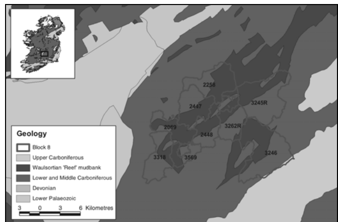
Map showing currently held Prospecting Licence areas over the southern part of the zinc-rich 'Rathdowney Trend' for which exploration data has just been released.

At 30 June 2006, a total of twenty-eight companies held 274 Prospecting Licences, primarily for base metals. During January to June 2006, a total of forty-four licences were issued. Twenty-seven licences were issued to Teck Cominco Ireland Limited , all for base metals, barytes, gold, silver, and Platinum Group Minerals. These included six licences in Counties Westmeath and Longford, northeast of the sub-economic Ballinalack zinc-lead deposit. They were also awarded ten licences in Counties Meath, Westmeath and Offaly. Together with licences already issued, Teck Cominco now has a large contiguous groundholding in the north Midlands of twenty-four licences, with others under application. They also received seven contiguous licences in south County Galway, north of the town of Loughrea , two adjoining licences in east Roscommon, west of Athlone , and two adjoining licences in north County Tipperary, immediately east of Portumna (County Galway). Lundin Mining Exploration Limited were awarded five adjacent licences in north County Limerick and one licence in County Longford, adjoining the Keel licence, already held by Lundin. Connemara Mining Co. Limited received one licence in County Limerick (adjacent to ground already held by them), and one licence in County Kildare. All of these licences are for base metals, barytes, silver and gold. Aurum Mineral Resources and Ormonde Mining were jointly granted five licences in County Wicklow