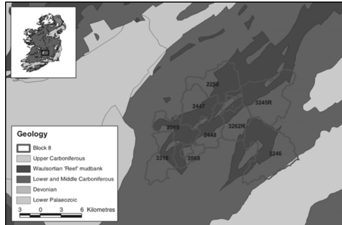
Map showing currently held Prospecting Licence areas over the southern part of the zinc-rich 'Rathdowney Trend' for which exploration data has just been released.

On the 11 th October 2004, a total of twenty-seven active companies held 273 Prospecting Licences, primarily for base metals. During the past six months, twenty-seven licences were issued. Twenty-one licences were issued to Connemara Mining Co. Ltd. These included a block of ten licences in south Co. Limerick / north Co. Cork (Kilmeedy), all of which were issued for base metals, barytes, silver, gold and Platinum Group Elements. The company were also granted five licences in east Co. Limerick (three at Fedamore and two at Holycross). These licences are for base metals, barytes and silver; the five licences are already held by Aurum Mineral Resources for gold. Connemara Mining also received a block of five licences in north Co. Meath / Co. Cavan (Oldcastle), all of which are for base metals, barytes, silver, gold and Platinum Group Elements. A single licence in Co. Kerry (Castlemaine,) for base metals, barytes, silver, gold and Platinum Group Elements, was also granted to the company. Oriel Selection Trust were granted five licences in Co. Mayo (Charlestown), for base metals, barytes, silver and gold. Finally, Dan Morrissey (Irl) Ltd was granted a licence in Co. Carlow / Co. Laois for coal and fireclay. Fifteen licences have been surrendered during the past six months.