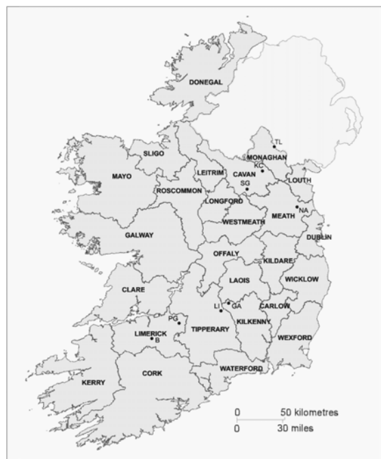
County Map of Ireland showing locations mentioned in the text. Bulgaden (B), Galmoy (G), Knocknacran (K), Lisheen (L), Navan (N), Pallas Green (PG), Slieve Glah (SG), Tully-Lisglassan (TL)

Asarco Exploration Company Inc. (Asarco) has undertaken a comprehensive technical review of its ground holding in Ireland. The ground holding covers an area of 555 sq. km, and is divided into five licence blocks. These are located in Cos. Kildare, Laois, Offaly, Tipperary and Limerick, where there are the same dolomitized Waulsortian Limestone Complex lithologies that host the Lisheen and Galmoy zinc-lead ore bodies. Asarco is seeking joint venture partners for their ground.