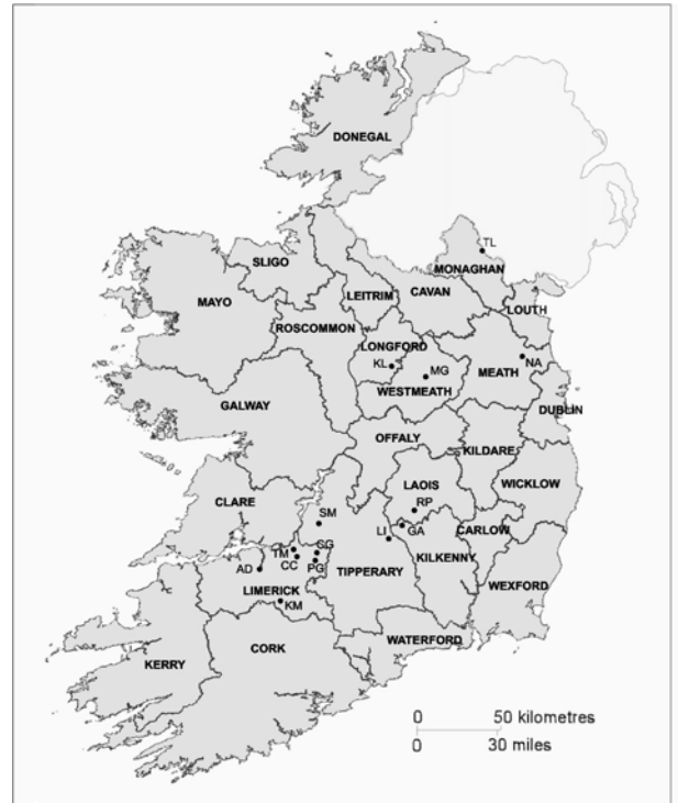
County Map of Ireland showing locations mentioned in the text. Adare (AD), Caherconlish (CC), Castlegarde (CG), Galmoy (GY), Keel (KL), Kilmallock (KM), Lisheen (LI), Mullingar (MG), Navan (NA), Pallas Green (PG), Rapla (RP), Silvermines (SM), Tobermalug (TM), Tullybuck-Lisglassan (TL)

Minco PLC (23.6%) and joint venture partner Falconbridge (76.4%), now a subsidiary of Xstrata PLC , continued their drilling programme on the Pallas Green project in east Co Limerick, where