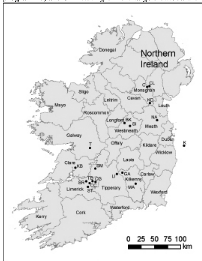
Figure 1: County Map of Ireland showing locations mentioned in text.

Aside from the 16 licences joint ventured with Connemara Mining in Co. Limerick, Teck Ireland Ltd holds 54 other licences throughout the Irish Midlands. In the past year, the company has drill tested targets on their Loughrea (Tynagh) and Sion Hill licence blocks. In 2009, Teck Ireland Ltd also entered into a joint venture exploration agreement with a Chinese company on their Ballinalack licence block. Teck will operate the programme, and drill testing of new targets outboard of the historic Ballinalack resource began in early 2010.