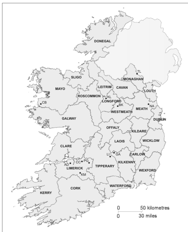
County Map of Ireland showing locations mentioned in the text. Adare (AD), Ballinalack (BK), Cregganbaun (CB), Caherconlish (CC), Galmoy (GY), Keel (KL), Kilmallock (KM), Lisheen (LI), Navan (NA), Pallas Green (PG), Tullybuck-Lisglassan (TL)

On the 10 th October 2005, a total of twenty-nine companies held 239 Prospecting Licences, primarily for base metals. During the past six months, three licences were issued. Arcon International Resources were granted a licence in Co Longford over area 186, which includes both the subeconomic Keel zinc deposit and significant barytes mineralization nearby, at Garrycam. The licence covers base metals, barytes and silver. Minco were awarded a licence in Co Limerick (PL area 3431), for base metals, barytes, silver and Platinum Group Elements. The area is immediately north of PL 636, also held by Minco, and part of the Minco-Noranda Pallas Green joint venture. Belmore Resources were issued a licence over PL area 3642 in Co Clare for base metals, barytes, silver and gold. The area lies immediately south of a block of eight licences in east Co Clare held by Belmore. A further twenty-two licences have been advertised and offered to a number of different applicants.